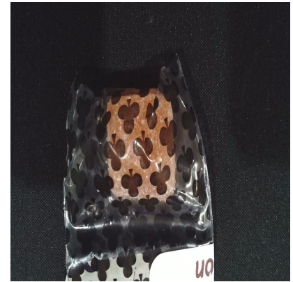
SERVING MASS (g): 5.34 SERVINGS/UNIT: 1